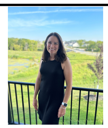
Mrs. Kennedy Sweet Potato Casserole and Stuffing